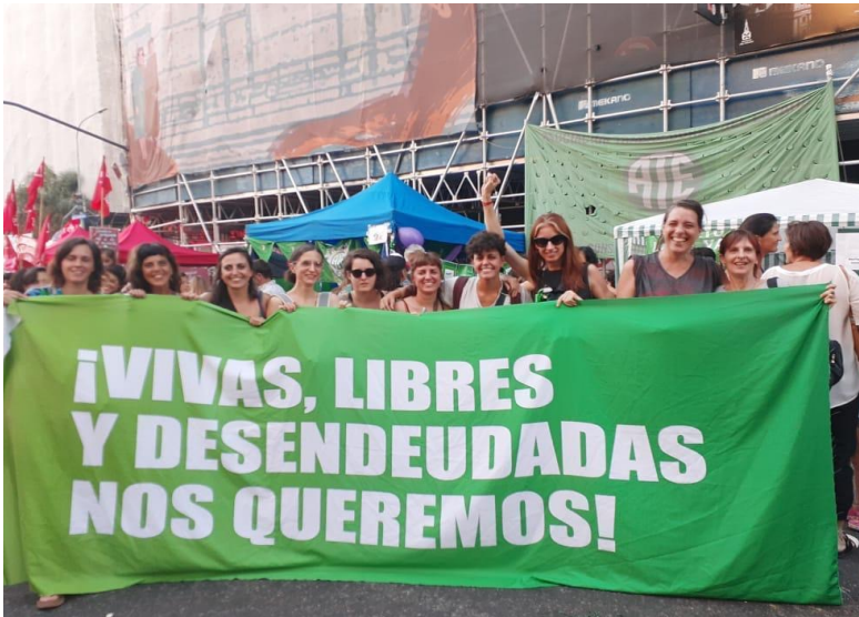
Image: Feminist Strike Mobilization in 2020, Banner of the Ni Una Menos Collective