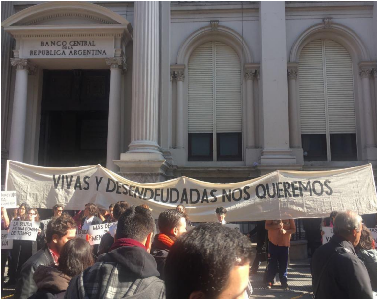
Image of the doors of the Central Bank of the Argentine Republic.

The slogan “We want to stay alive, free, and debt free!” also synthesizes a method for carrying out practical research in everyday life about to whom the debt is owed, how debts exploit and take away autonomy from women, lesbians, travestis, and trans people. It also shows how the debate about femicides and travesticides must be deepened by looking at the economic causes that function as gears of gender-based violence.