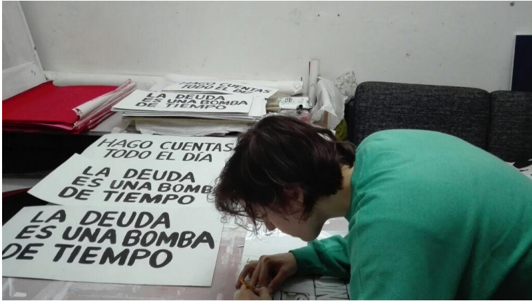
Image: A member of the Ni Una Menos Collective making posters with the slogan for the action in front of the Central Bank.