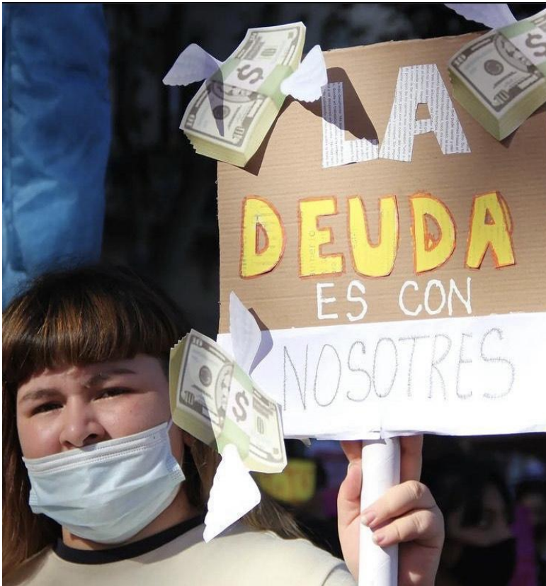
Image of the Feminist Strike Mobilization in 2022